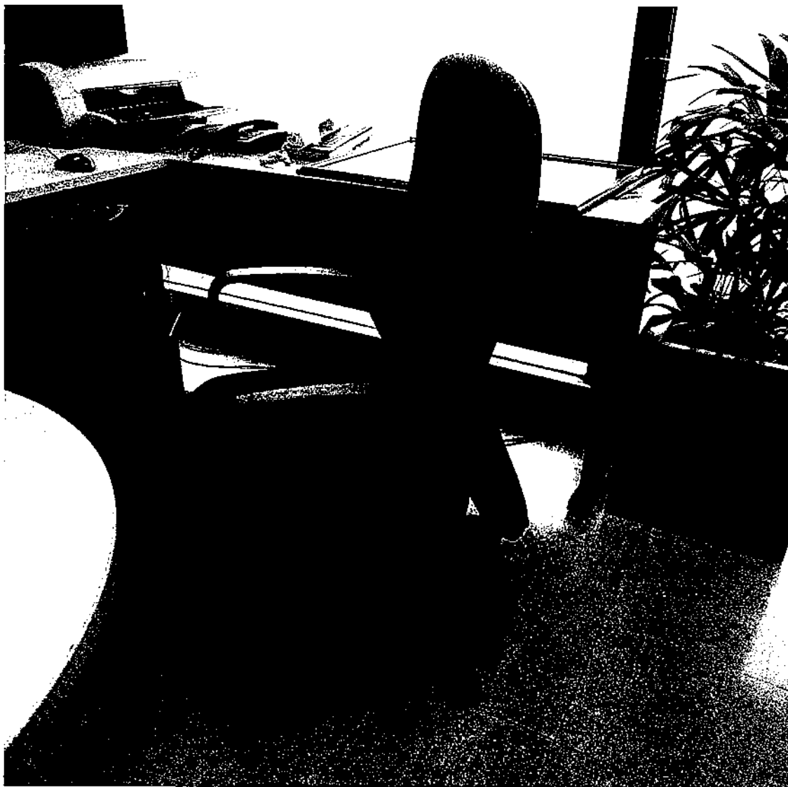
MODEL OF CHAIR